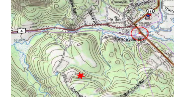
Fernwood Farms Road