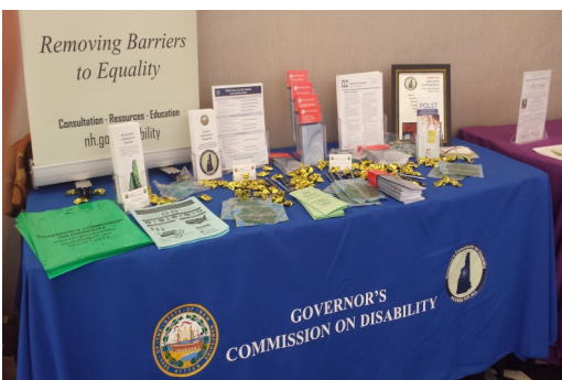
A display table prepared by the GCD for the Annual Caregiver's Conference in Concord, NH